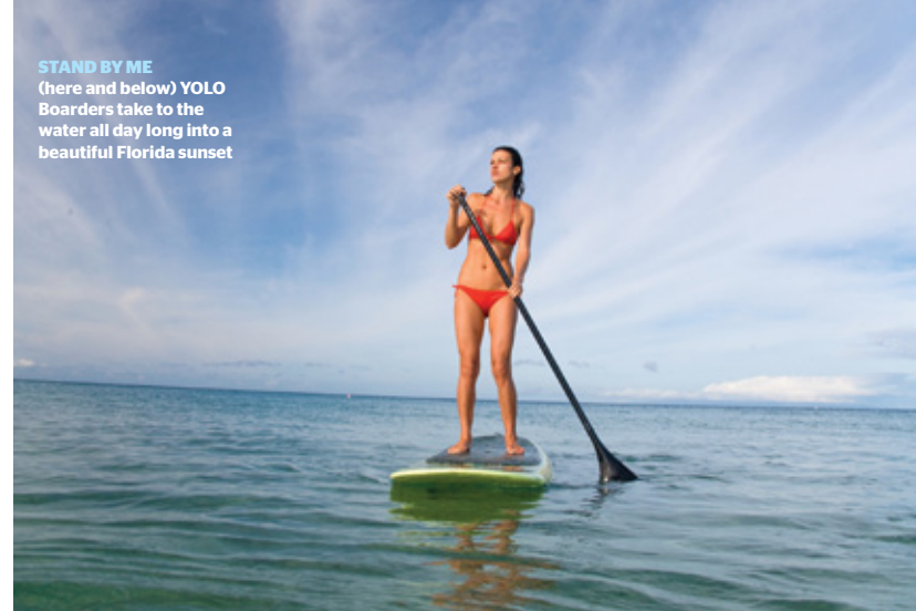
STAND BY ME (here and below) YOLO Boarders take to the water all day long into a beautiful Florida sunset

Beginner paddlers are often surprised at how easy it is