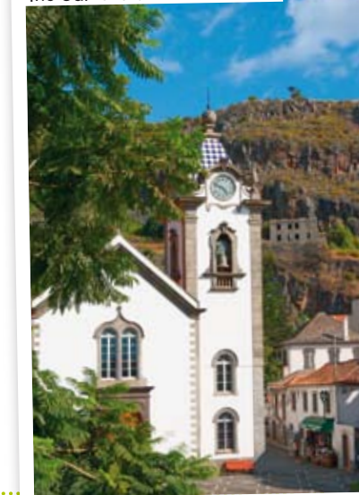
The Catholic Church in Funchal

To discover more winter sun destinations check out tntmagazine.com/travel