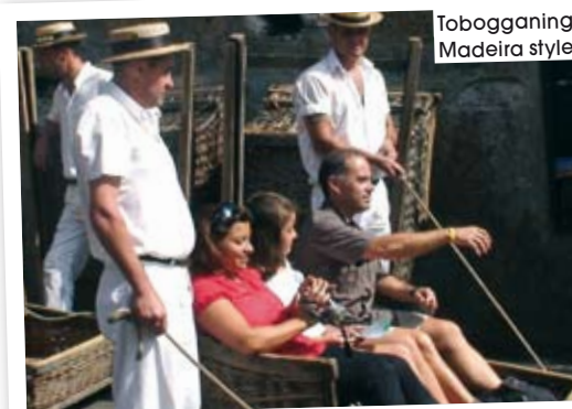
Tobogganing Madeira style